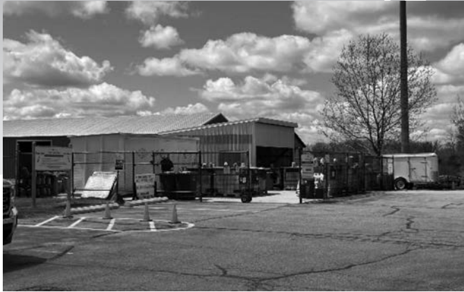
2025 Home Toxics Center Saturday Collection Calendar (PDF) link: https://content.civicplus.com/api/assets/8ec93965-4cd8-40f6-8ec4-8bf8e51e9558

Registration is required to attend a collection. Collections will be held on select Saturdays, from April through November. No events will be held on holiday weekends.